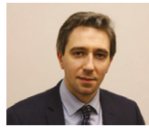
Minister Simon Harris T.D Minister for Further and Higher Education, Research, Innovation and Science