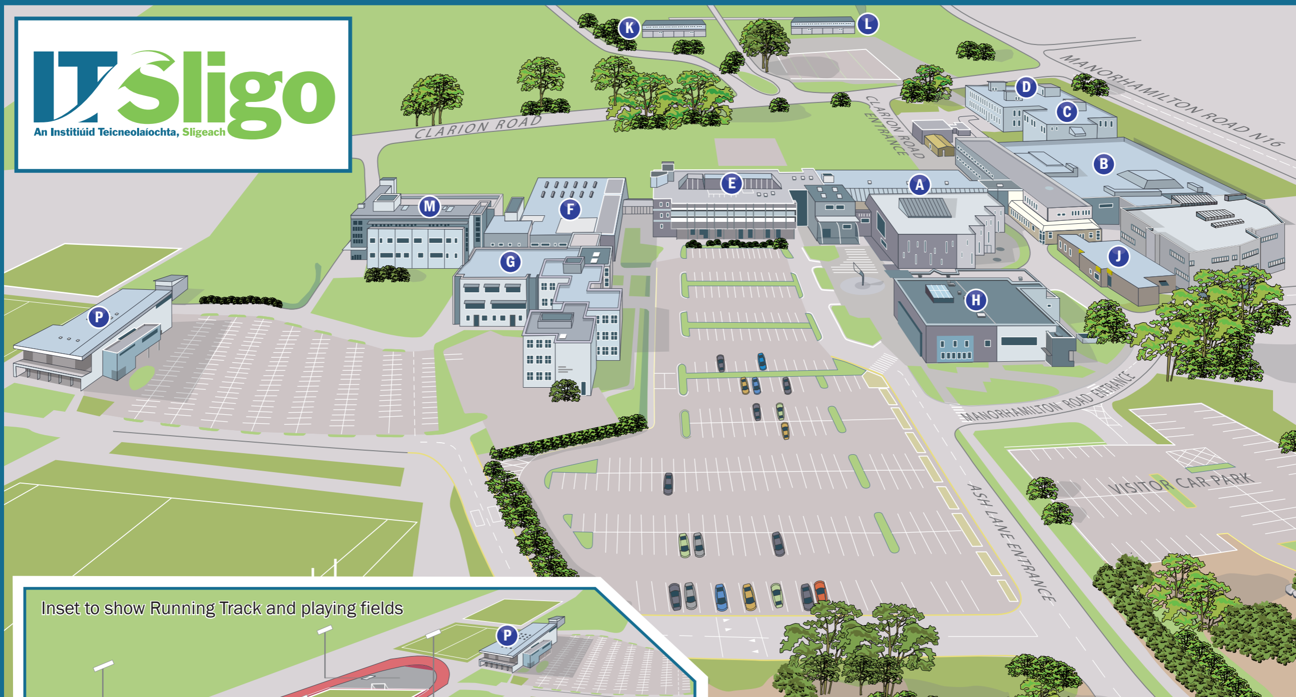
Inset to show Running Track and playing fields